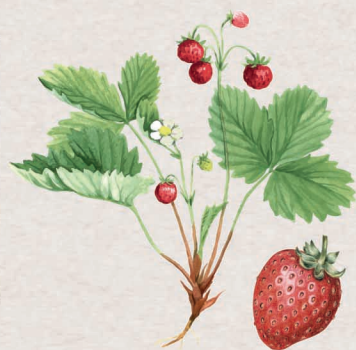
Fragaria vesca (Strawberry)