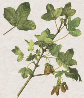
Acer monspessulanum (Montpellier maple)