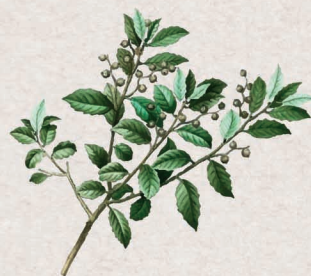
Quercus ilex (Holm oak)