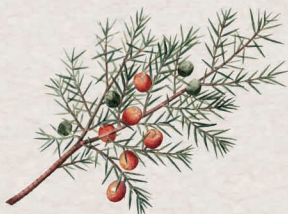
Juniperus oxicedrus (Prickly juniper)