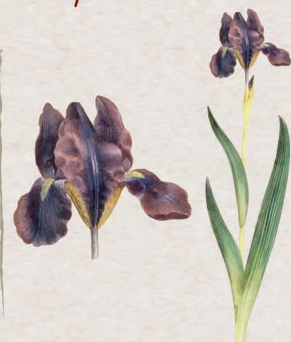
Iris Sp. (Lily)