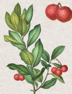
Arbutus unedo (Madrone)