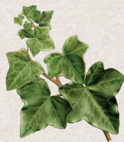
Hedera hélix (Ivy)